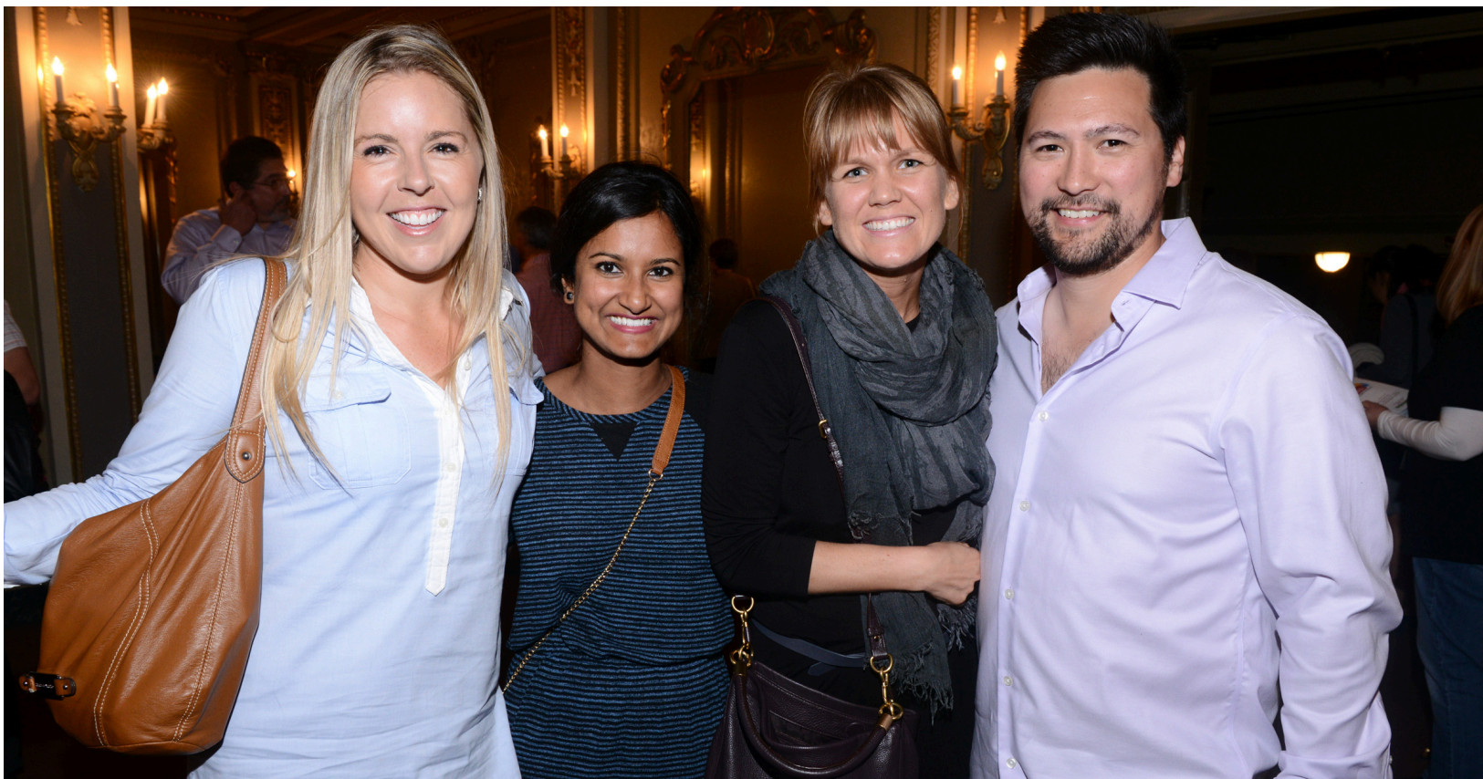
A Way with Words fans at a live event in Dallas in 2015.